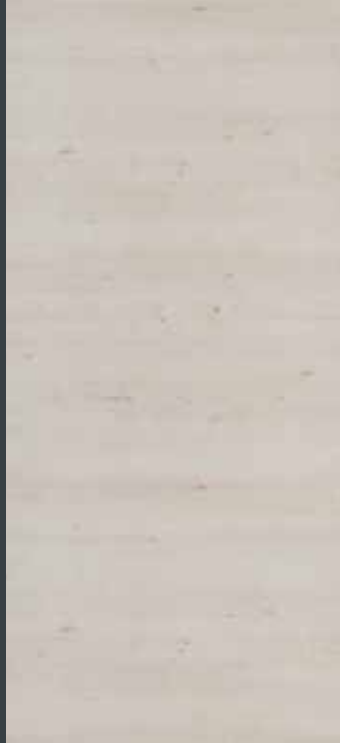
Érable Féroé Horizontal