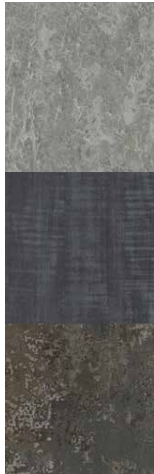
▲ From top to bottom, in the Materials range : Schiste Clair and Shibori are amongst the new decor trends from the Mineral Collection whilst Underground Founte enlarges and enriches our Metallic collection.